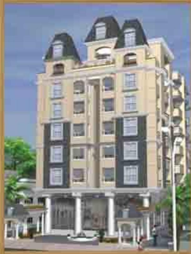
Commercial Plot No. 7 (JDA Scheme), Subhash Nagar, Jaipur